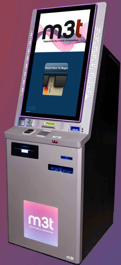
Model Shown: RT2400C