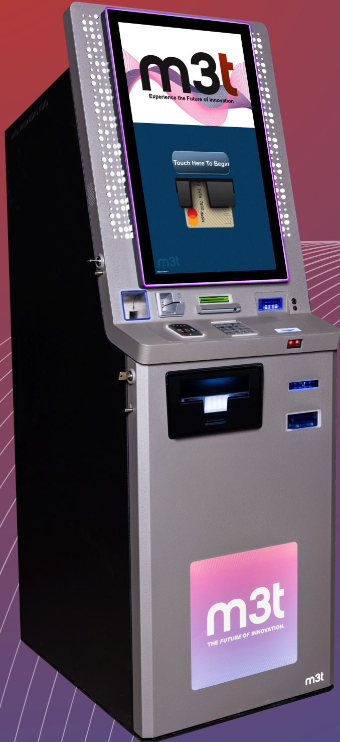
Model Shown: RT2400